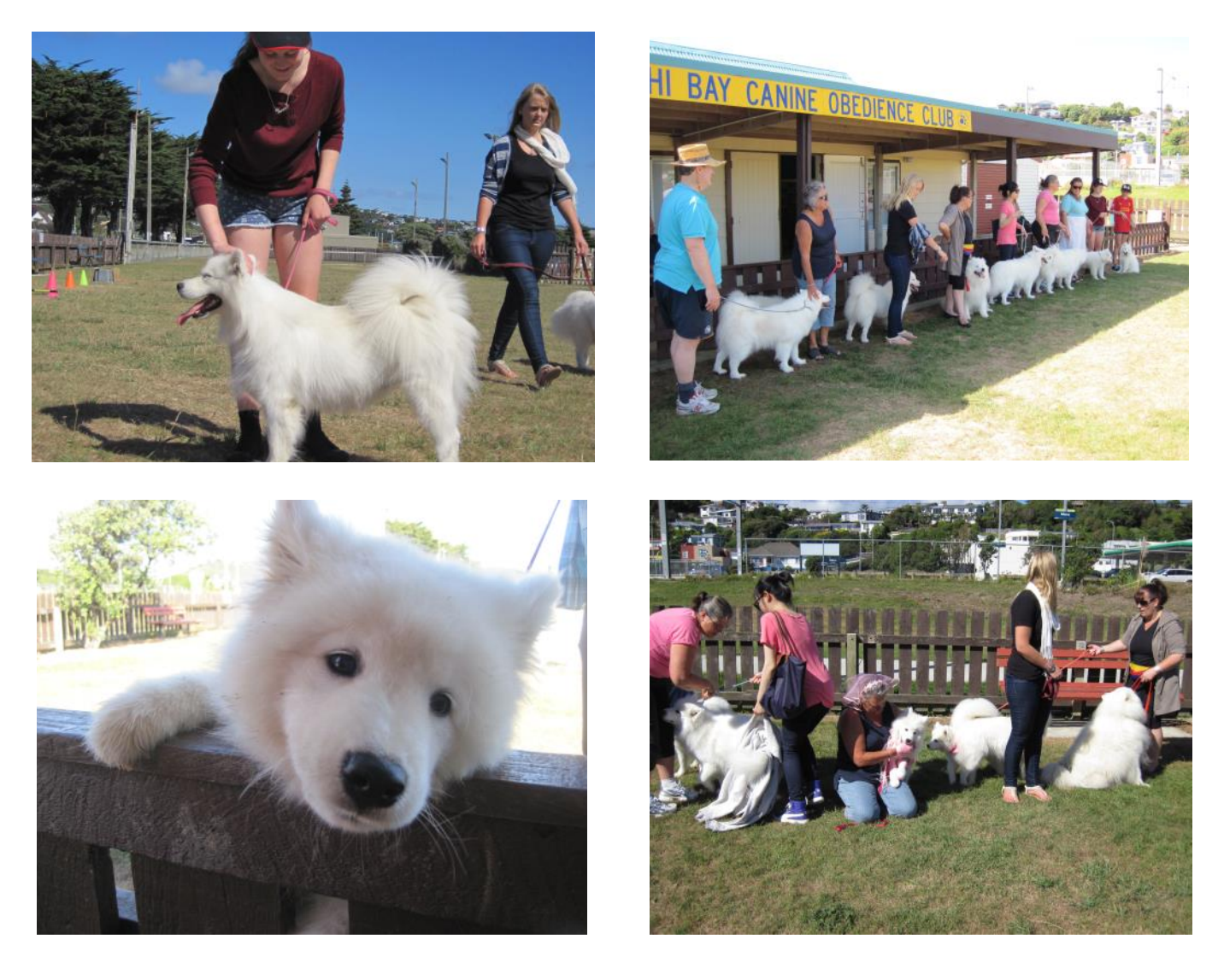
Thanks to our Fun Day Sponsor Butch