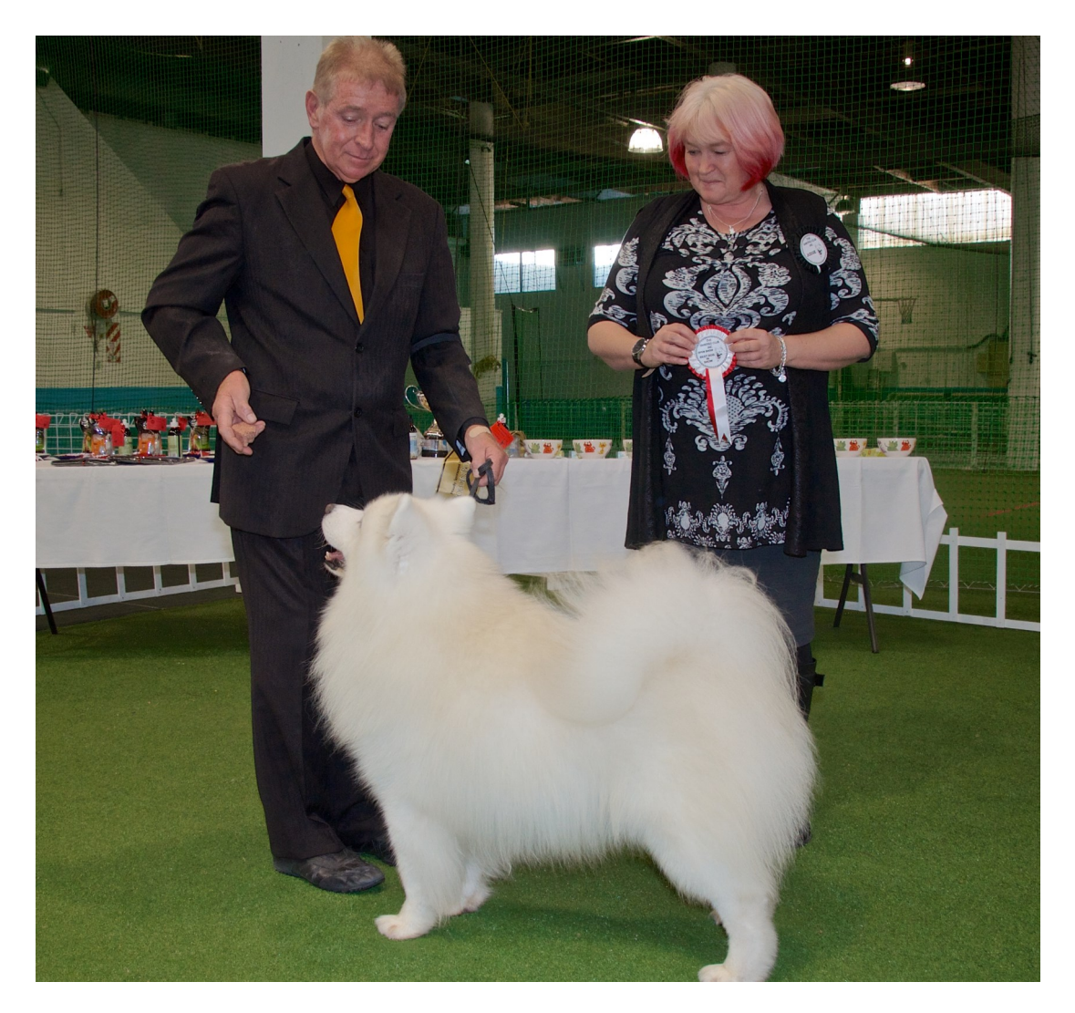
Best Dog: CH OSCARBI IM A BARK STAR (Barzey/Clark) Best Bitch: ZAMINKA LOVE ME TENDER (Carleton/Bello)