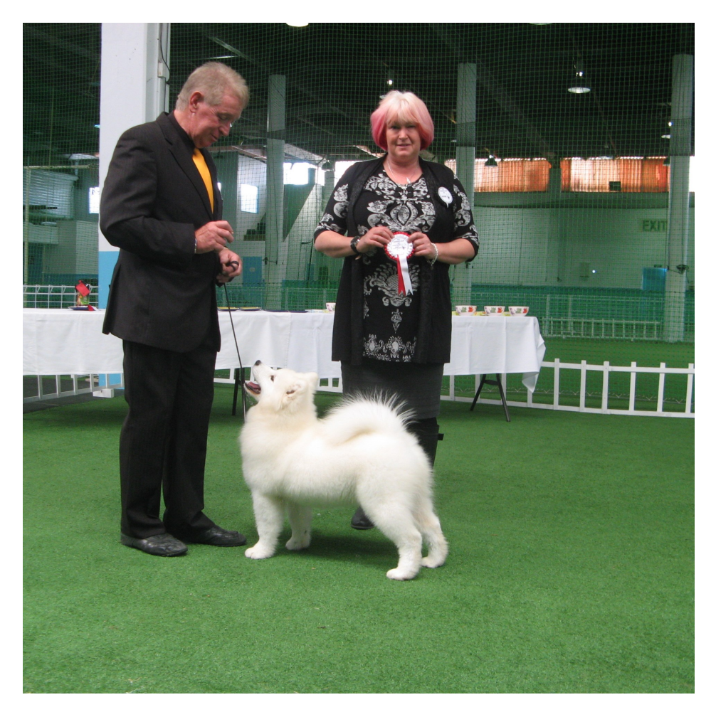
Best Baby Puppy in Show: OSCARBI SEW WOT KID (Barzey/Clark)

Best Puppy in Show: KALASKA LOOK AT ME GO DADDY AT OSCARBI (IMP AUST) (Barzey/Clark)