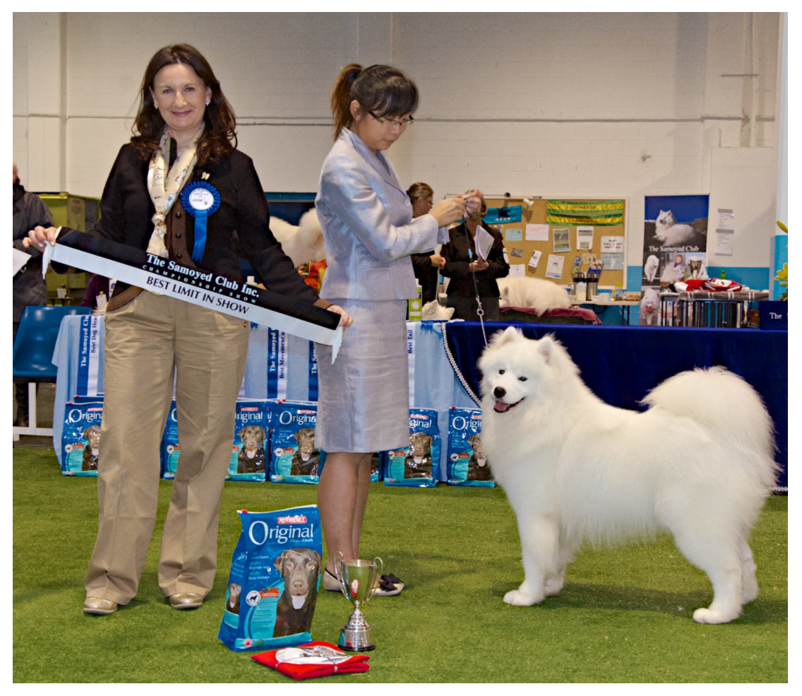
Best Limit in Show: BEYOND SOLID GOLD (Yau)