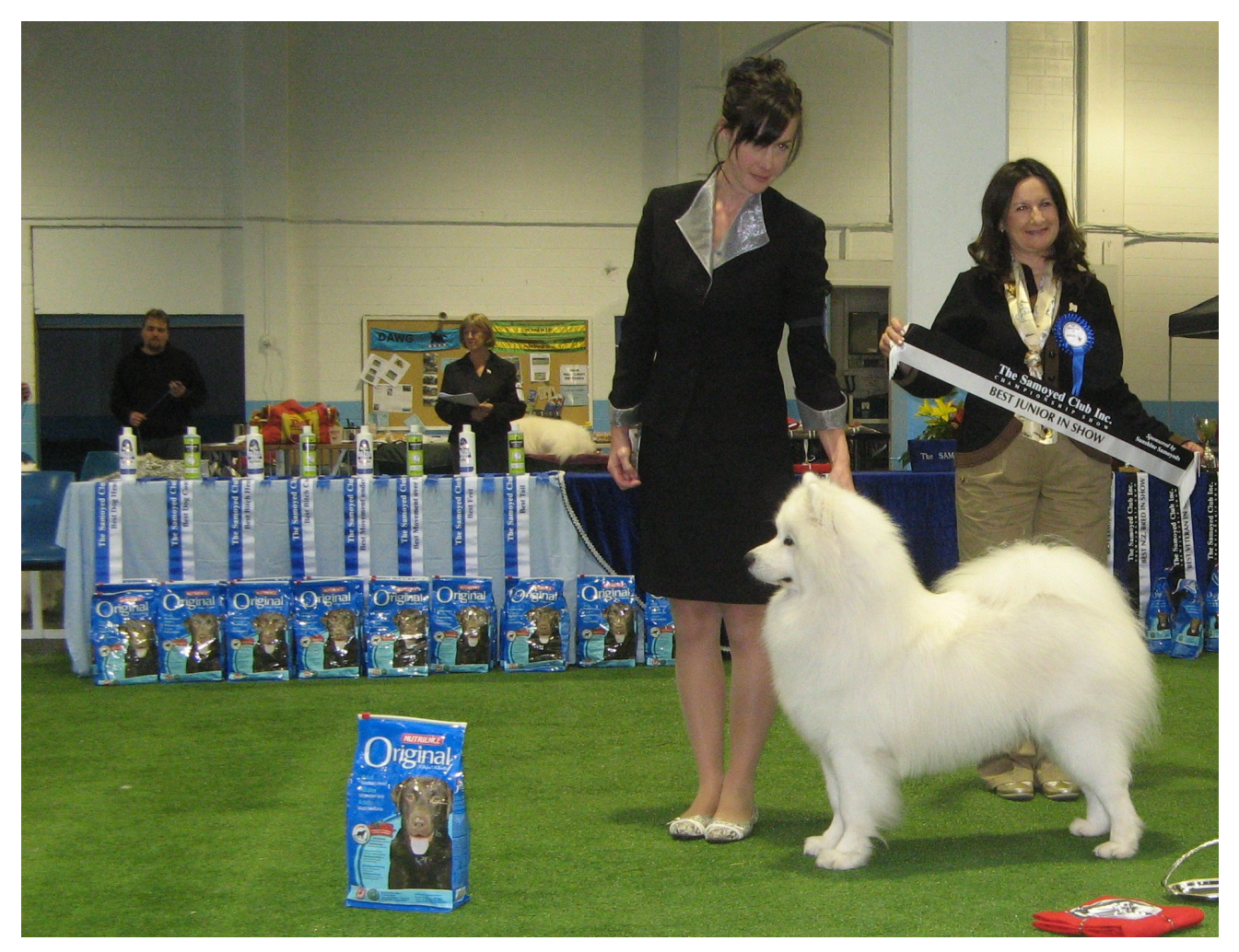
Best Junior in Show: CH ZAMINKA THAT COOL CAT (Carleton/Bello) Best Intermediate in Show: CH OSCARBI EVEREDI BOY (Barzey/Clark)