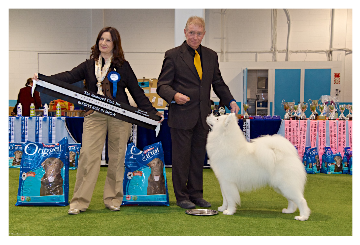
Reserve Best Dog in Show: KALASKA LOOK AT ME GO DADDY AT OSCARBI (IMP AUST) (Barzey/Clark) Reserve Best Bitch in show: ANAKY SAY YOU LOVE ME (IMP AUST) (Barr)