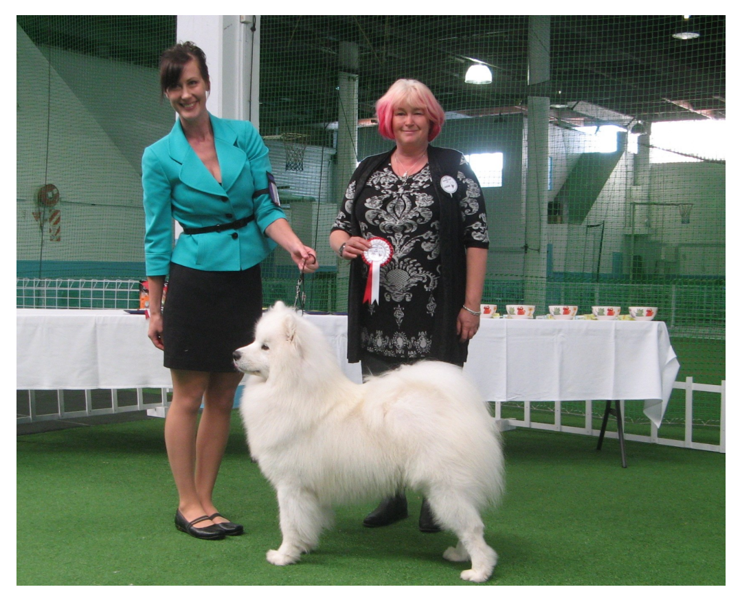
Best Junior In Show: CH ZAMINKA THAT COOL CAT (Carleton/Bello)