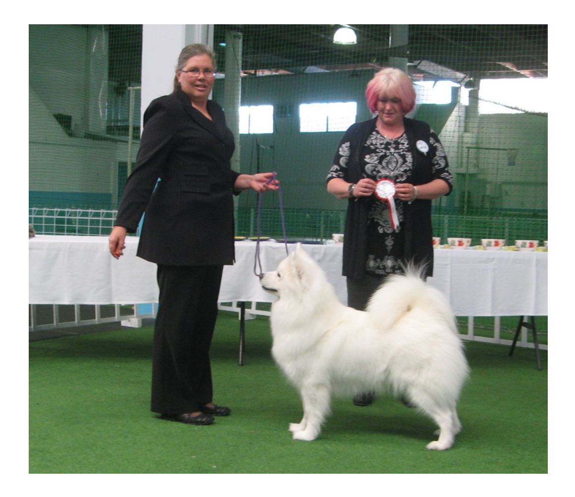
Best Veteran in Show: CH ANGARA DANCING WITH THE STARS (Barr)