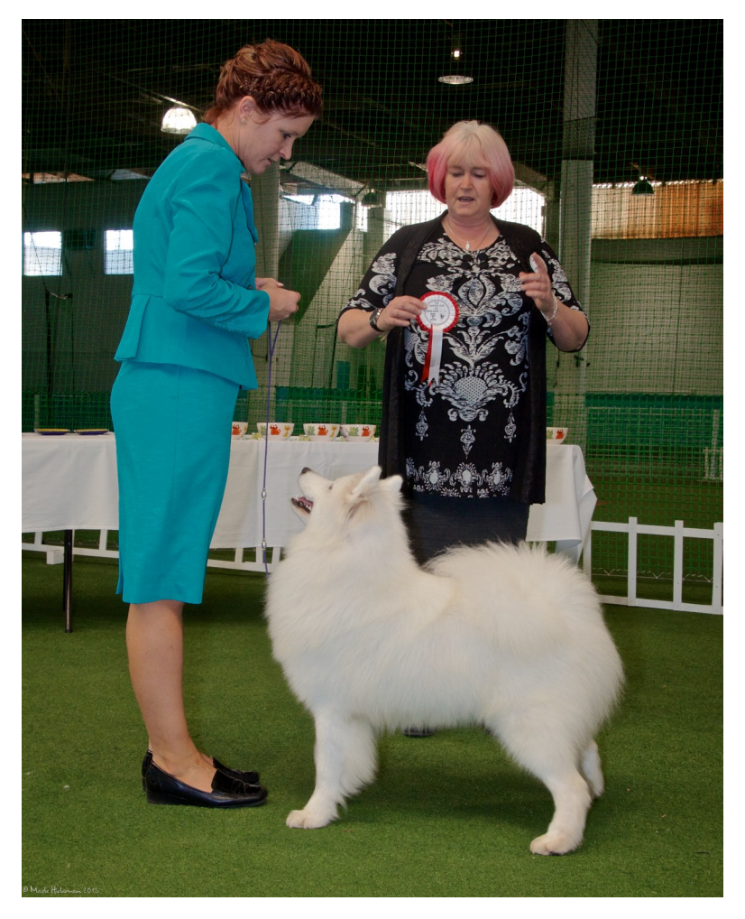
Best Limit in Show: ZAMINKA LOVE ME TENDER (Carleton/Bello)