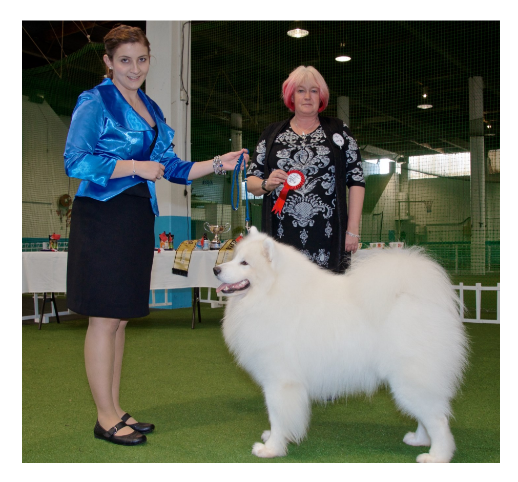
Reserve Best Dog in Show: CH LEALSAM SETS A STYLE (Maisey)