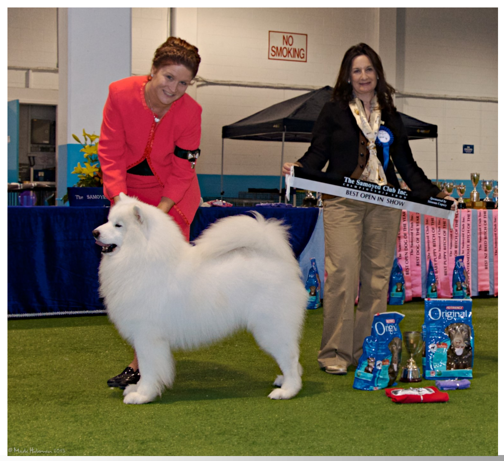
Best Open in Show: CAN, AM, ENG CH & NZ GR CH VANDERBILT'S ONE COOL CAT (IMP CAN) (Carleton/Bello)