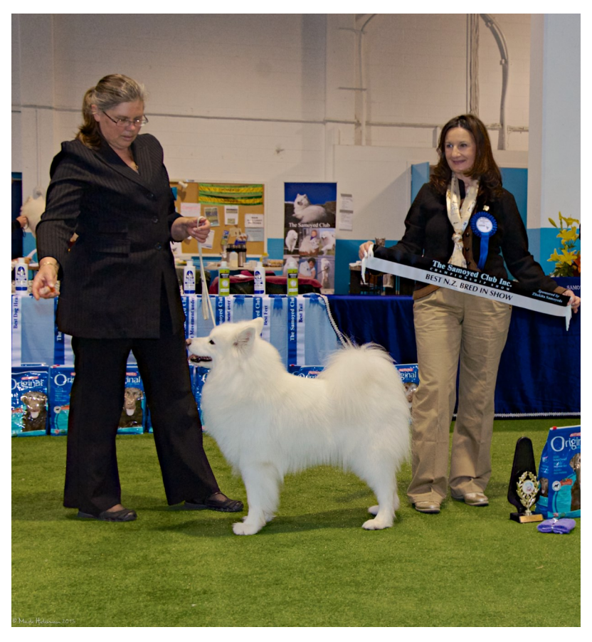
Best NZ Bred in Show: CH ANGARA SNEAKING ME KISSES (Barr)