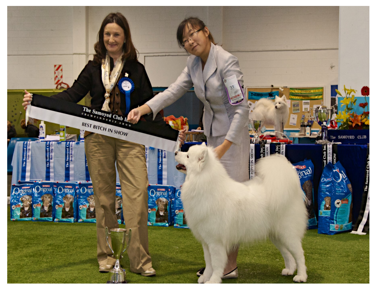
Best Bitch: NZ CH SNOCOZY VOYAGE TO BEYOND (IMP AUST) (Yau/Wen)

Best Dog: CAN, AM, ENG CH & NZ GR CH VANDERBILT'S ONE COOL CAT (IMP CAN) (Carleton/Bello)