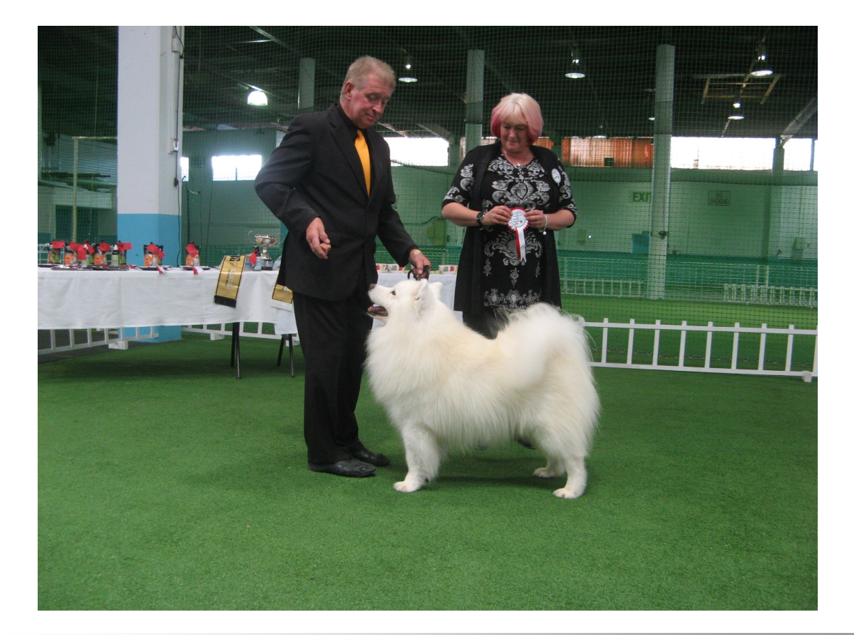
Best Open in Show: CH OSCARBI IM A BARK STAR (Barzey/Clark)