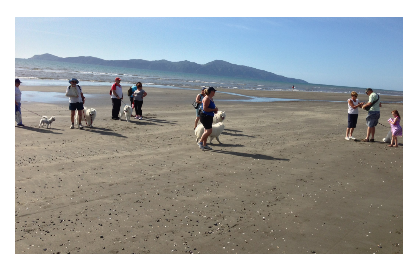
And now, the long walk home ......... Can someone please explain why the way back is always up-hill?