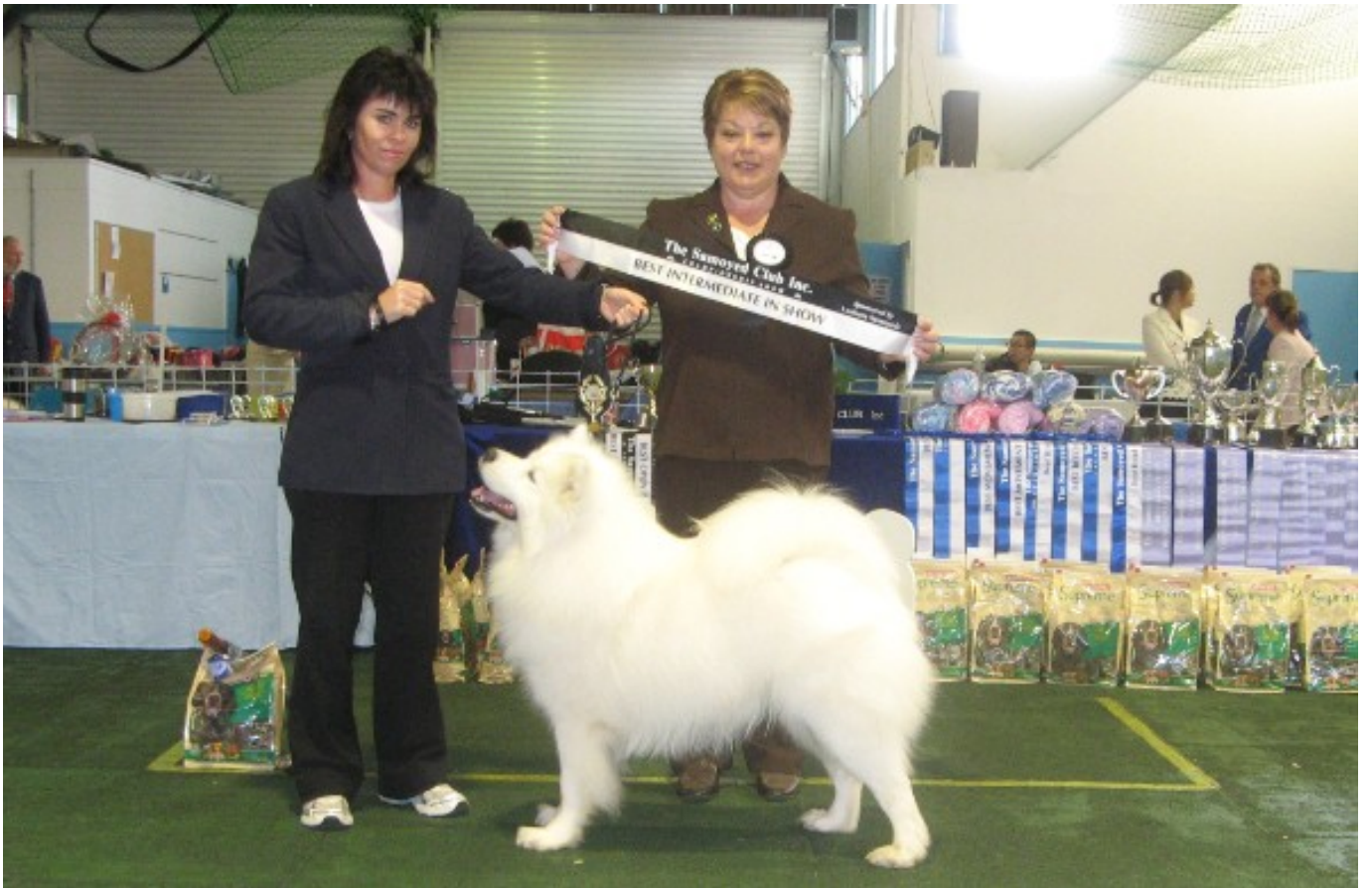
Best Intermediate in Show: CH SUNSHINE TRI TEDDY (Shugg)