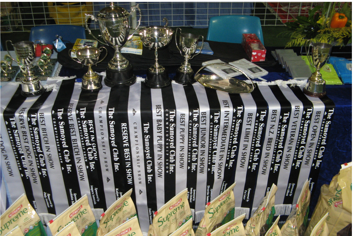
Some of the prizes from the Championship Show