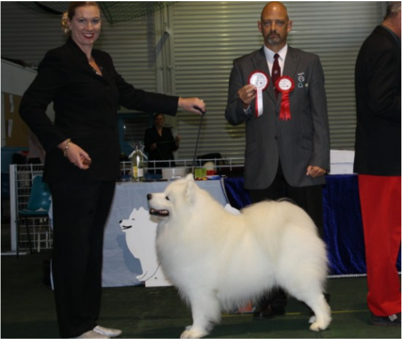
Best Open in Show: NZ CH KALASKA ASTRO BOY AT OSCARBI (IMP AUST) (Barzey, Clark)