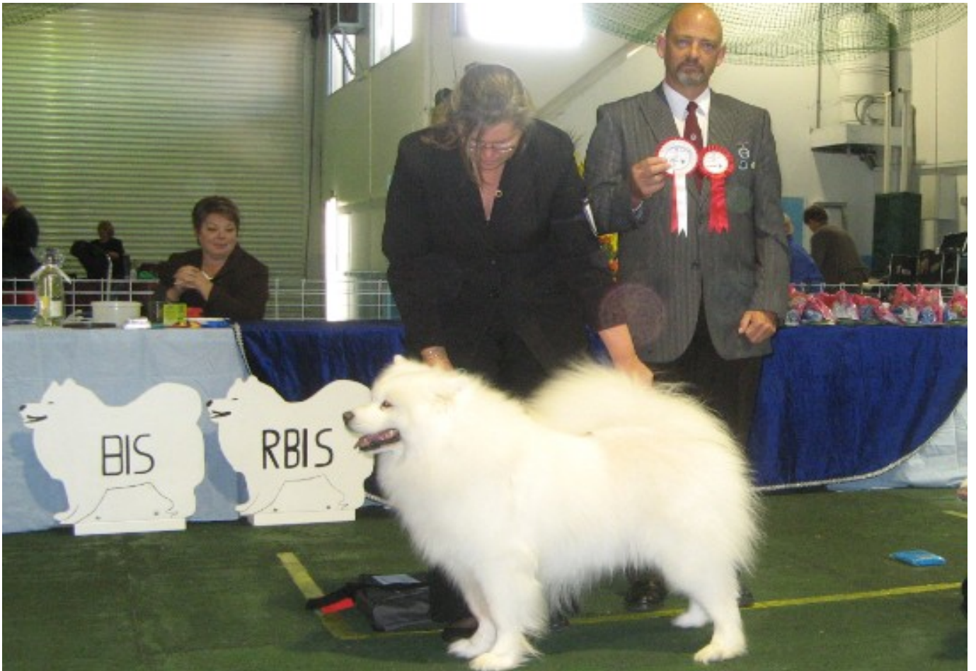
Best Veteran in Show: NZ AUST CH ANAKY ITS PARTY TIME (IMP AUST) (Barr)