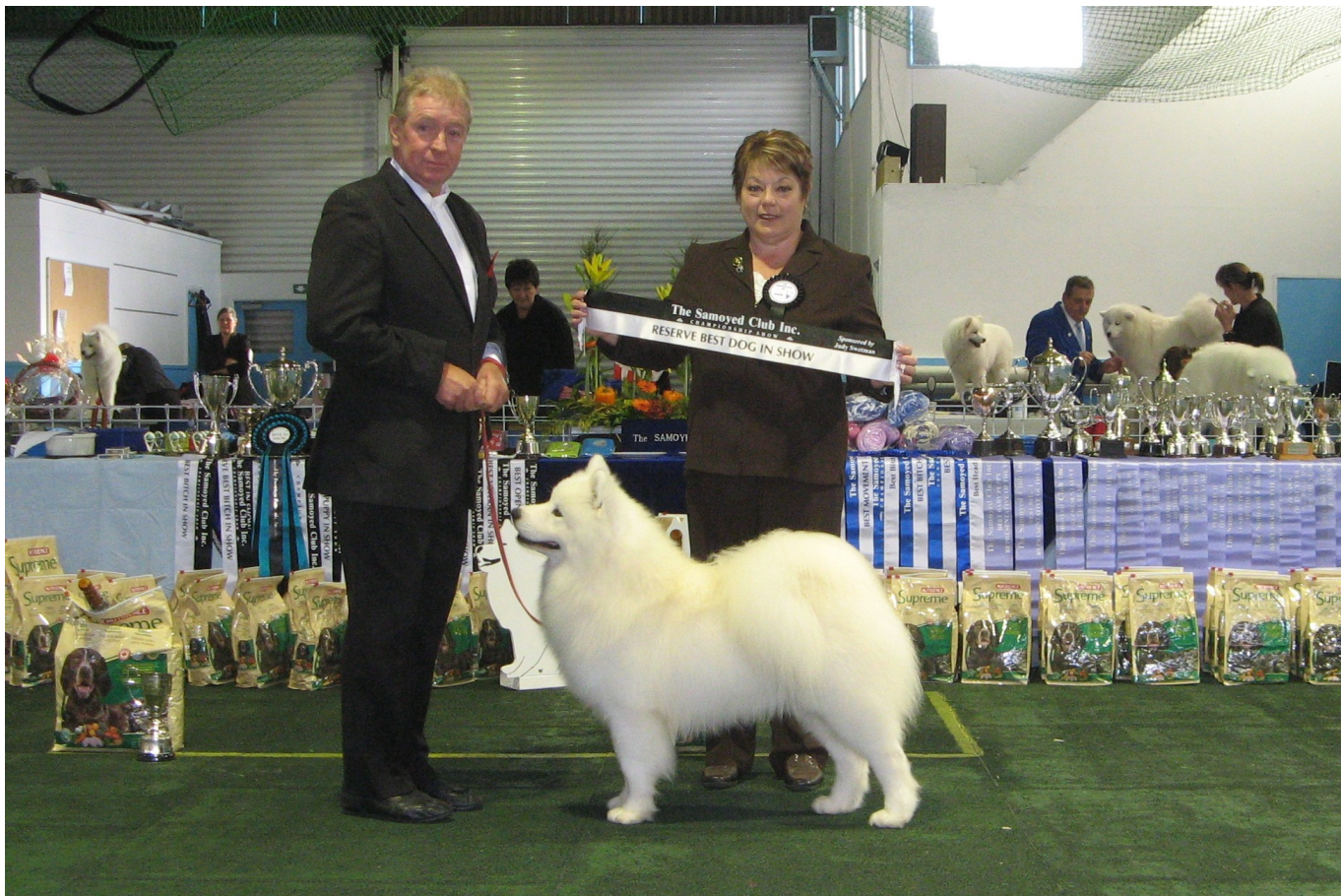
Reserve Best Dog in Show: OSCARBI EVEREDI BOY (Barzey, Clark)