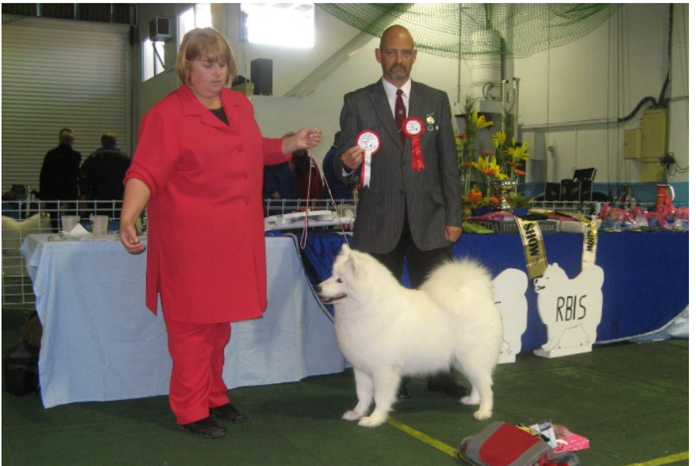
Best Bitch: CH SAMHAIN ECHO'N T WITH KURSHARN (Wells)