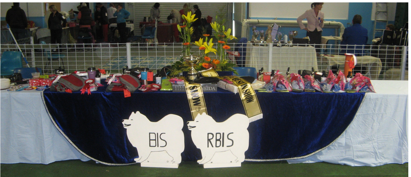
Prize and trophy table at the Open Show