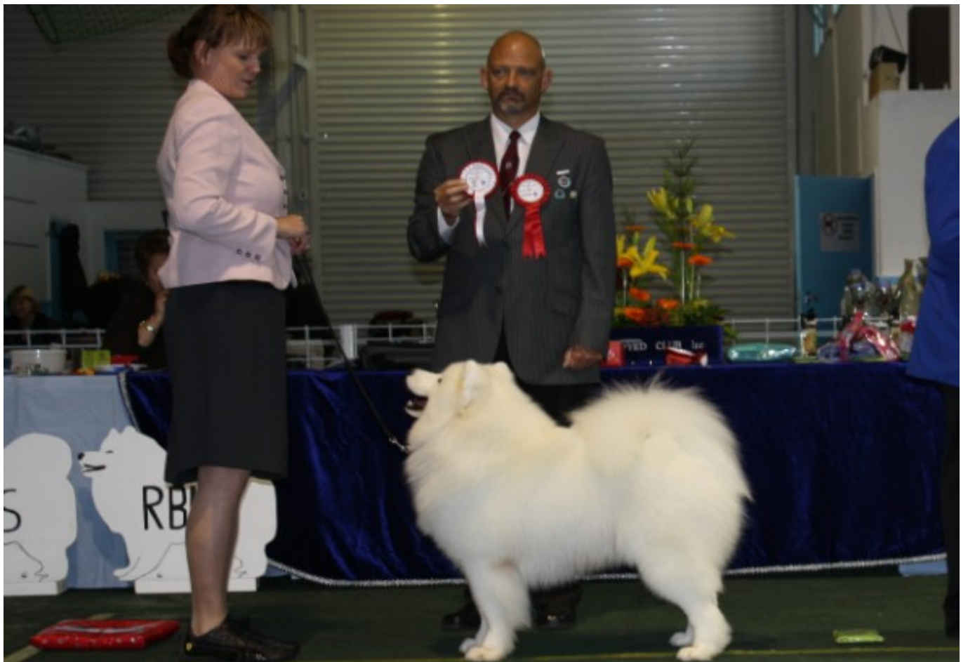
Best Puppy in Show: LEALSAM DANCE IN THE DARK (Magnus)