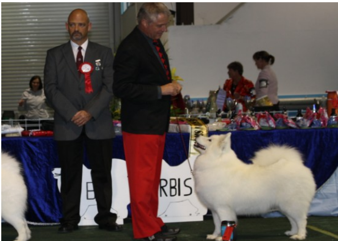
Reserve Best Bitch in Show: CH OSCARBI FUTURE EXCITEMENT AT CARRIDENE (Barzey, Clark, Matheson)