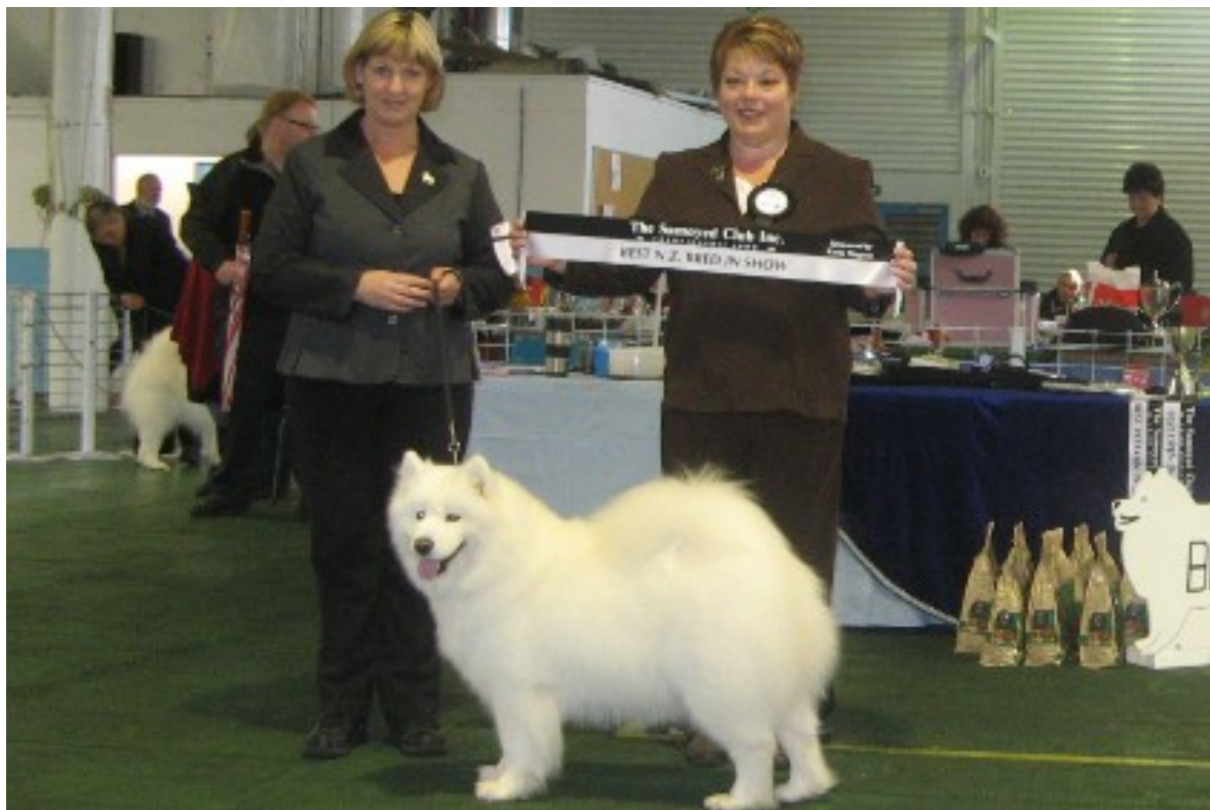
Best NZ Bred in Show: CH ZAMINKA MAGIC MOMENTS (Swetman)