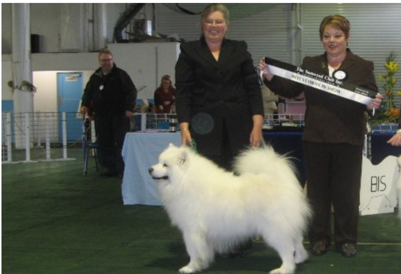
Best Veteran in Show: NZ AUST CH ANAKY ITS PARTY TIME (IMP AUST) (Barr)