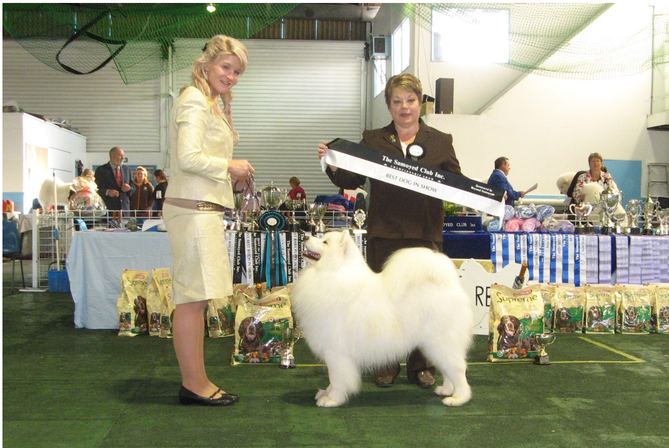
Best Dog: CAN&AM&ENG&NZ GR CH VANDERBILT'S ONE COOL CAT (IMP-CAN) (Carleton, Bello)