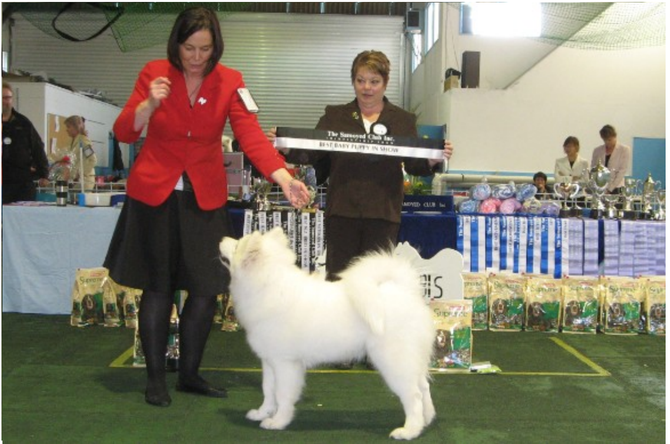
Best Baby Puppy in Show: KURSHARN VINTAGE-VANTAGE (Wells)