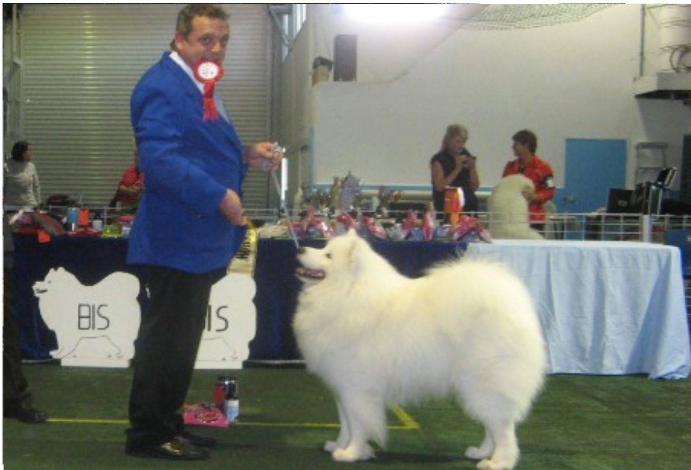
Reserve Best Dog in Show: LEALSAM SETS A STYLE (Maisey)