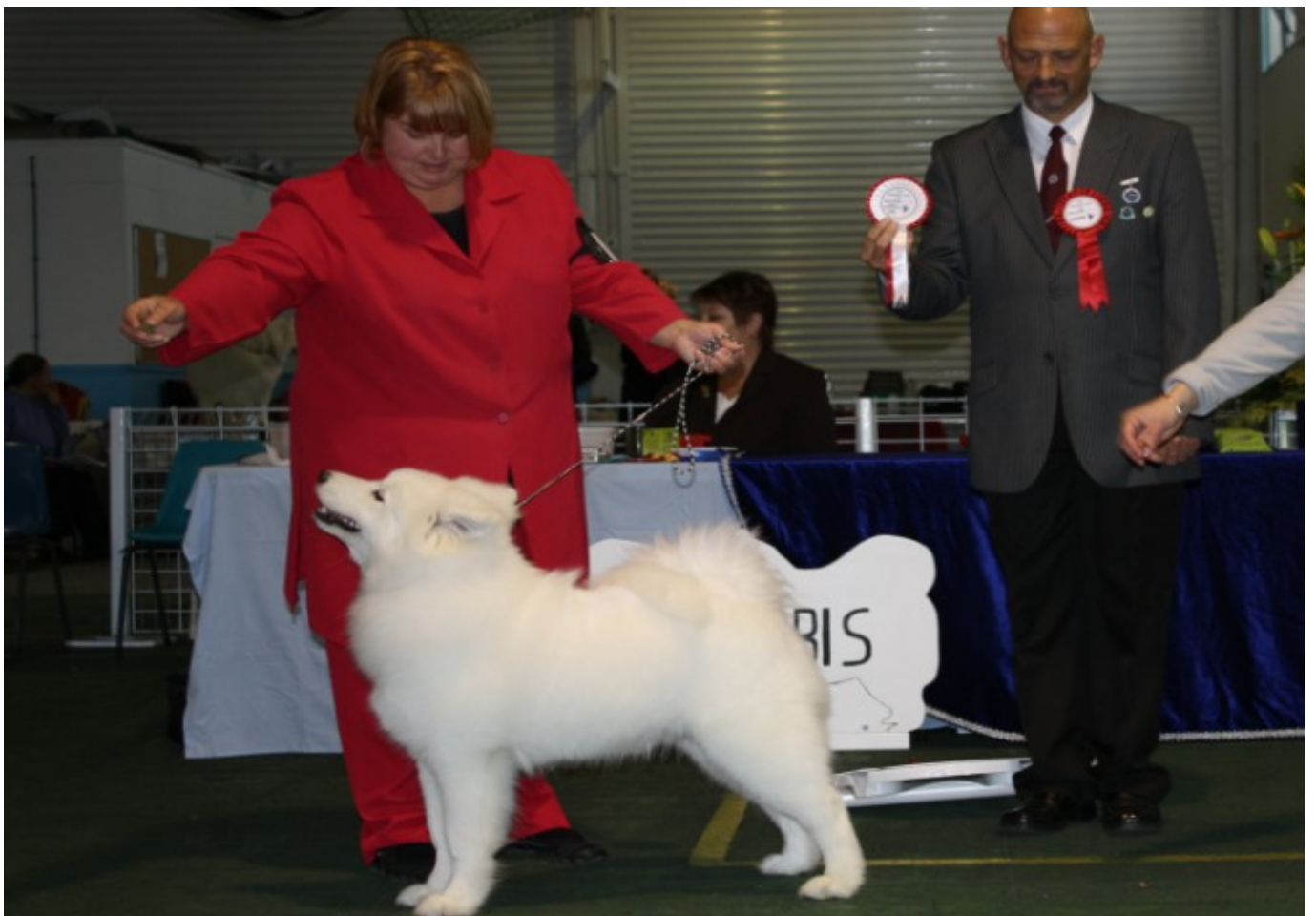
Best Baby Puppy in Show: KURSHARN VINTAGE-VANTAGE (Wells)