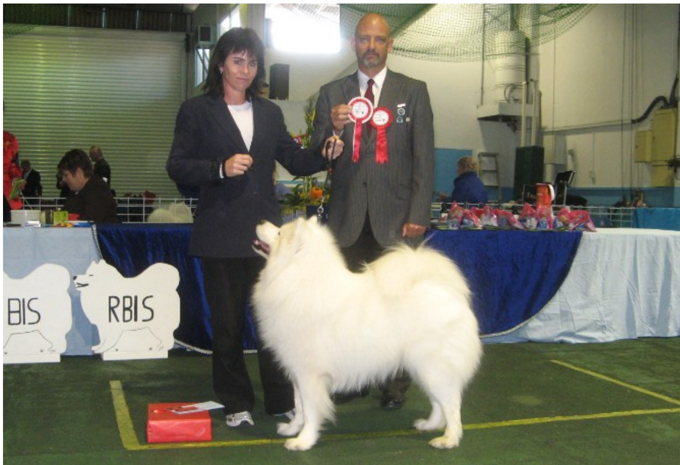
Best Intermediate in Show: CH SUNSHINE TRI TEDDY (Shugg)