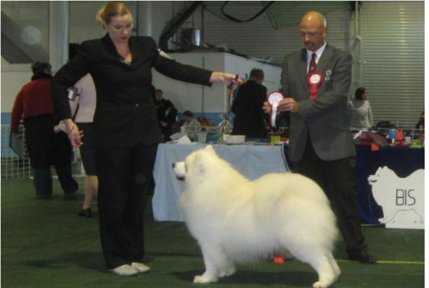
Best Dog: NZ CH KALASKA ASTRO BOY AT OSCARBI (IMP AUST) (Barzey, Clark)