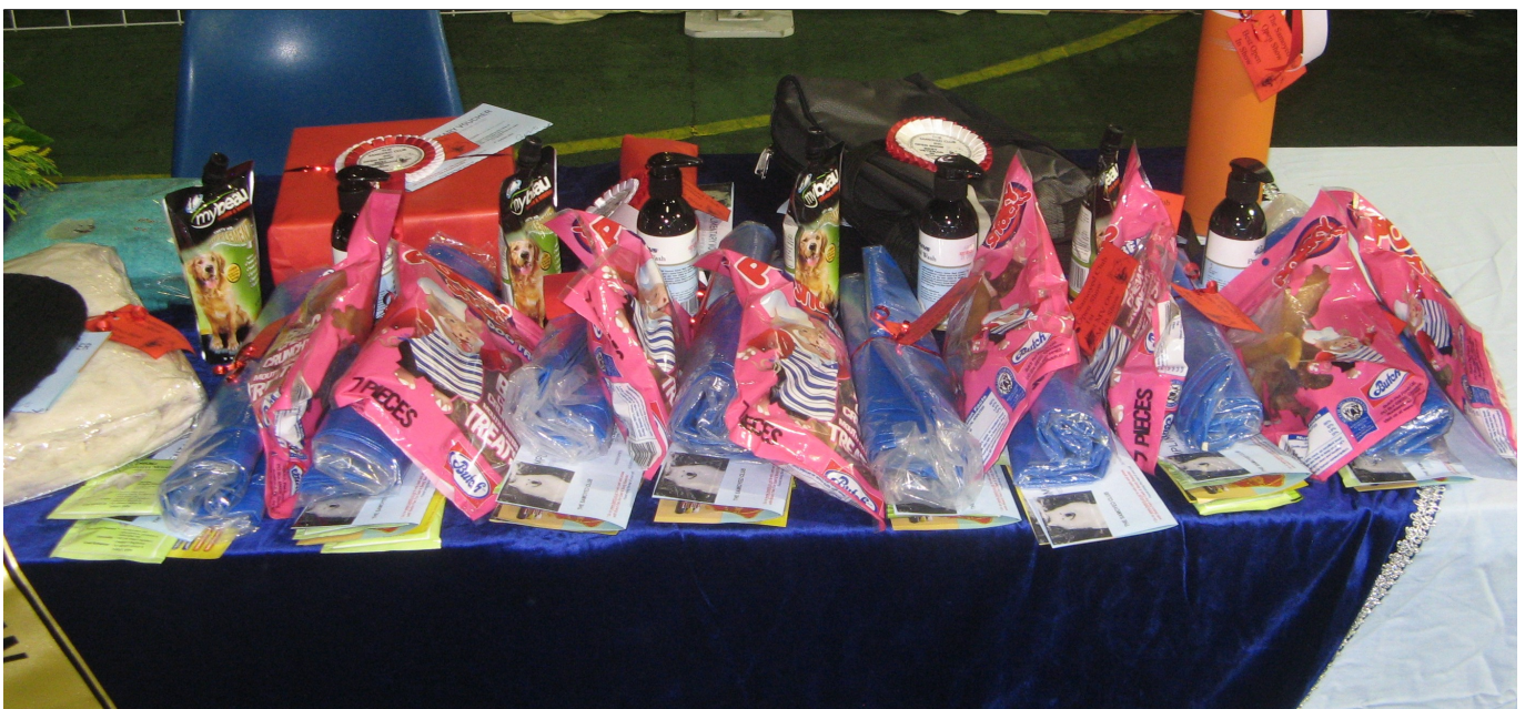
Some of the prizes at the Open show

Reserve Bitch CH OSCARBI FUTURE EXCITEMENT AT CARRIDENE (Barzey, Clark, Matheson)