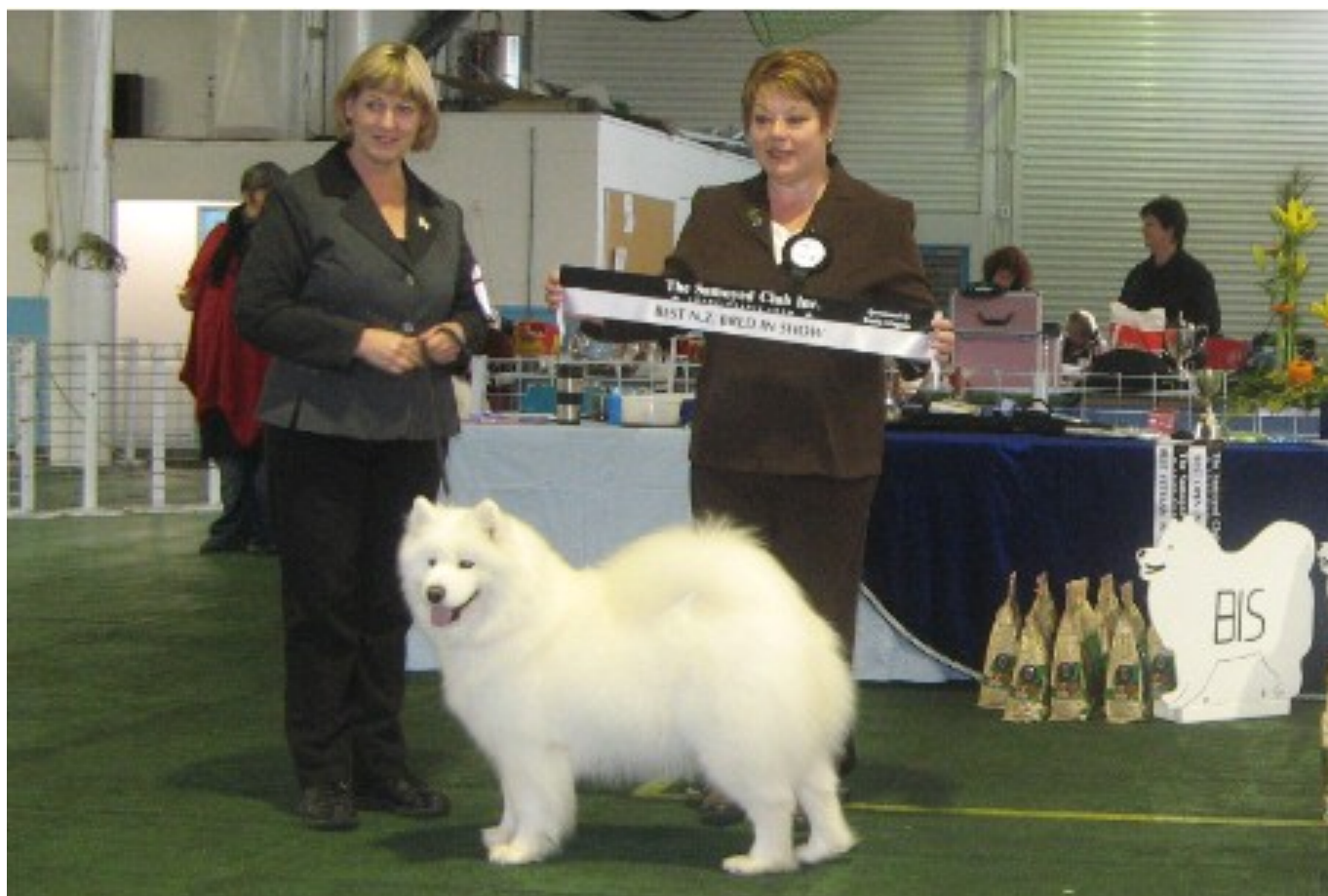
Reserve Best Bitch in Show: CH ZAMINKA MAGIC MOMENTS (Swetman)