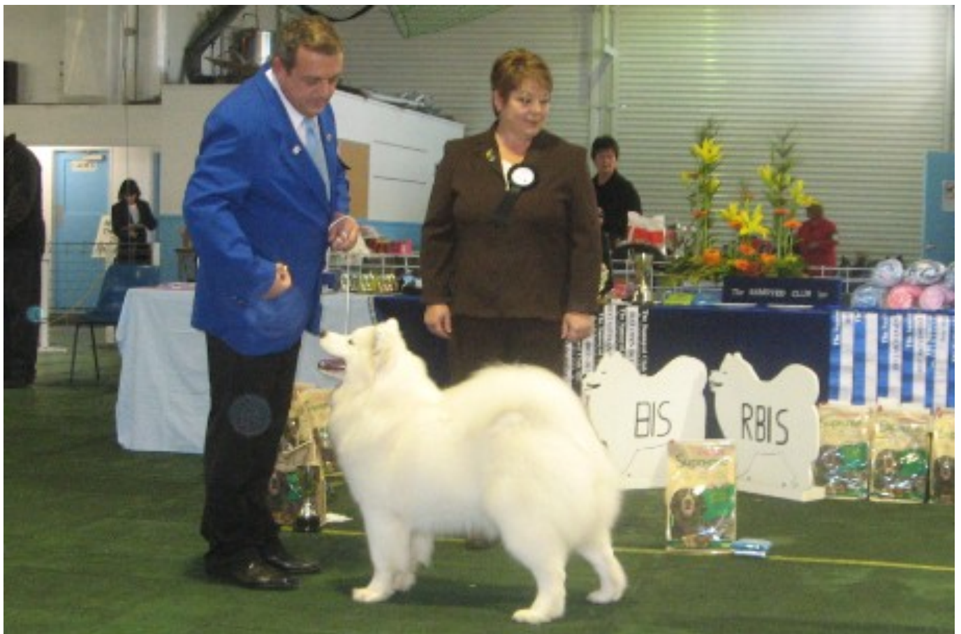
Best Puppy in Show: LEALSAM JUST DANCE (Reeve)