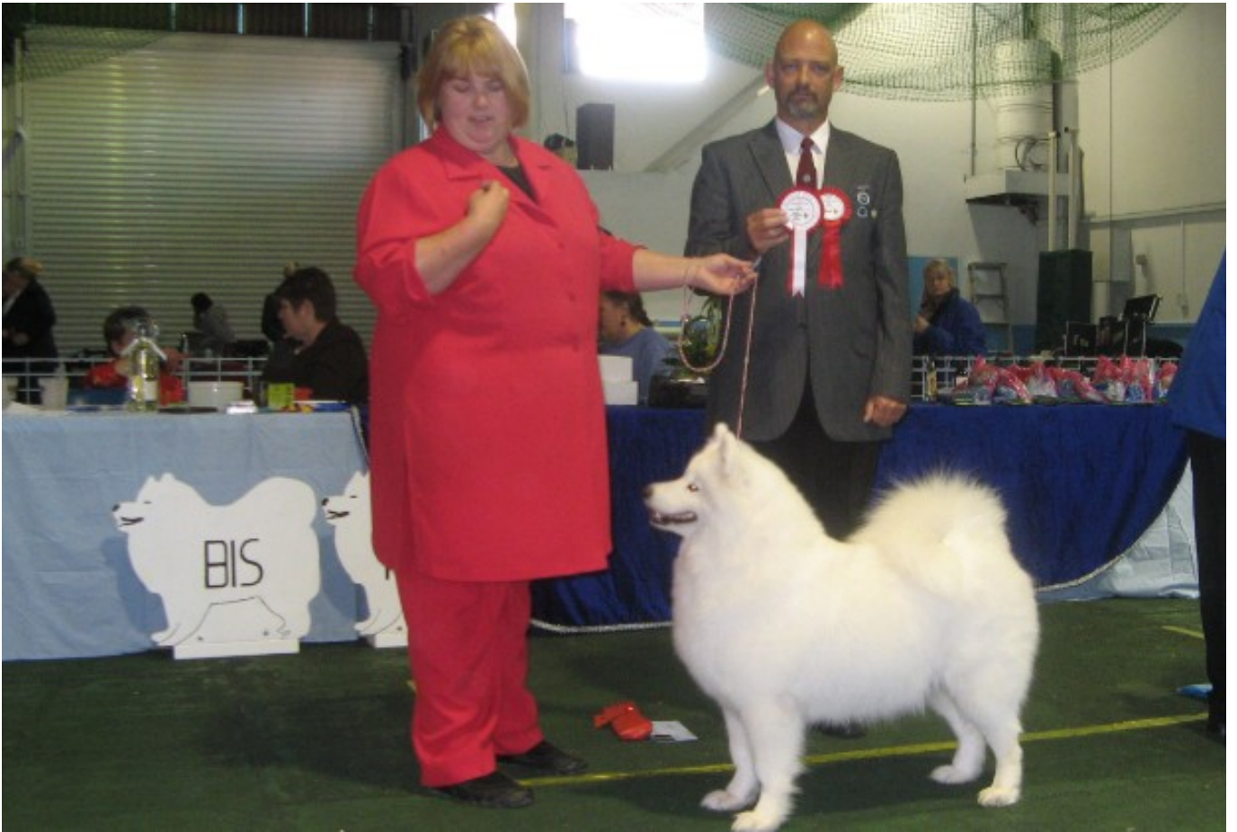
Best NZ Bred in Show: CH SAMHAIN ECHO'N T WITH KURSHARN (Wells)