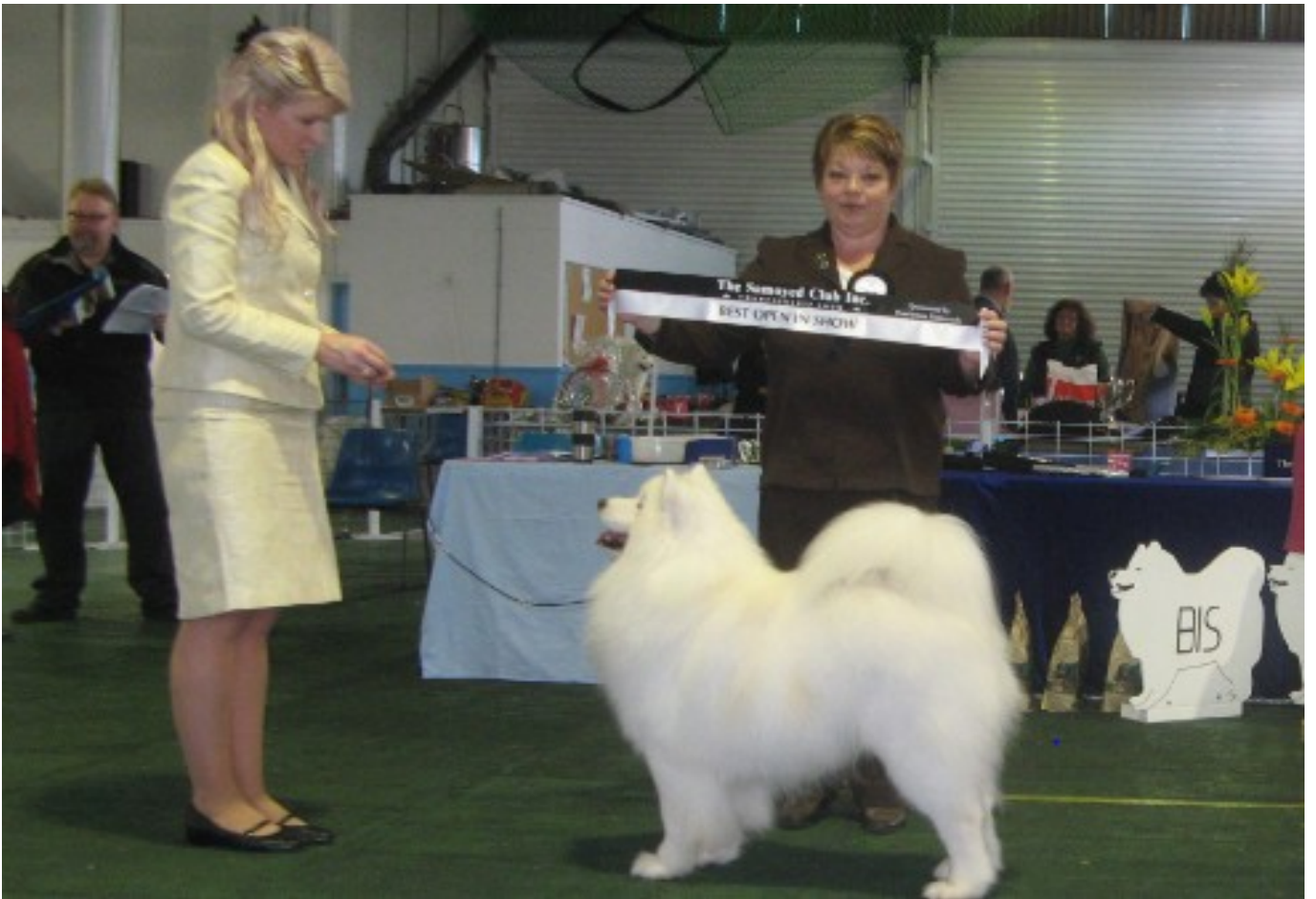
Best Open in Show: CAN&AM&ENG&NZ GR CH VANDERBILT'S ONE COOL CAT (IMP-CAN) (Carleton, Bello)