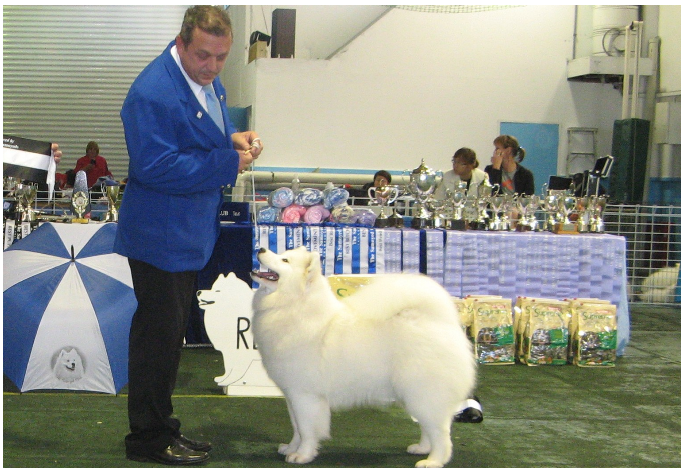
Best Bitch: LEALSAM JUST DANCE (Reeve)