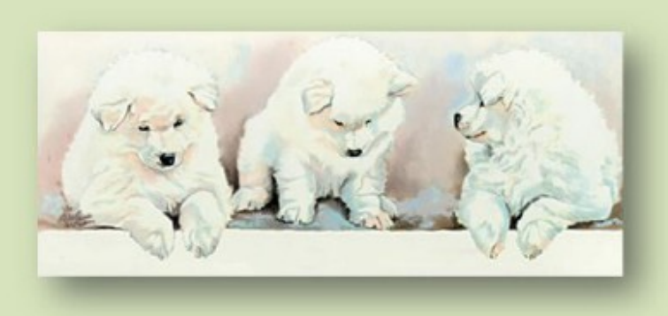
Due 18 December 2012

Sire: Aust Chilce River Mezen Yoshi And Us (Imp.Slvk) - Phoenix