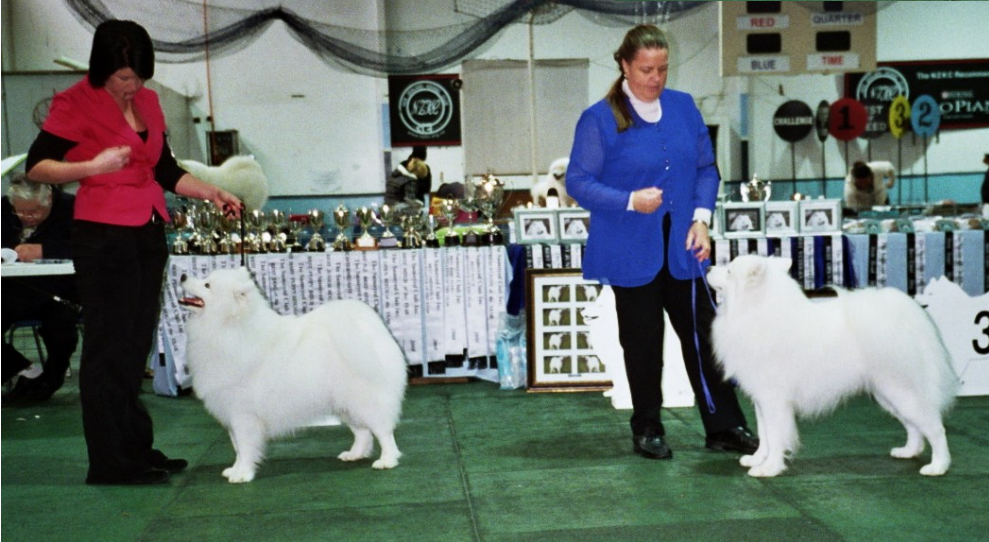
Left: Limit Dog 1st Zaminka One Vision 2nd Sunshine Klasic Kruz