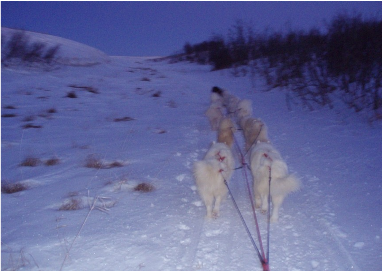
Team climbing out of Sheyenne River Valley at sunset

(mainly freight dogs) and that it is not just racing as many people seem to think. Gee, haw, gangline, neckline, tighten up, stanchion, snow hook – you go what? You learn what commands are used, all about the equipment, safety on the trail plus how to handle a sled. You can help harness dogs, hook them up to the sled plus you get a chance to drive the team with the musher right there with you.