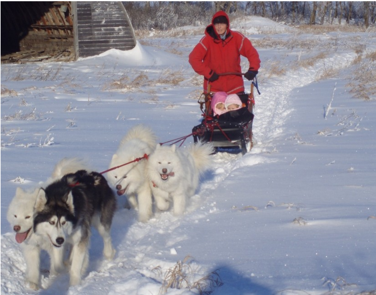
Two children having a fun ride with 4 Prairie Isle sled dogs