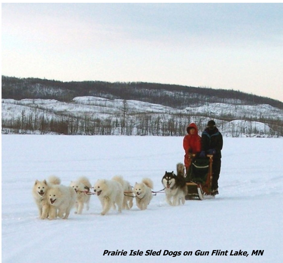
Prairie Isle Sled Dogs on Gun Flint Lake, MN

At present we have 21 dogs, with 16 still working in harness and 5 are retired. From reading books, magazines and checking out internet information on dog sledding I knew I had to try this with the dogs I had at the time: one Golden, one Malamute and 2 Samoyeds.