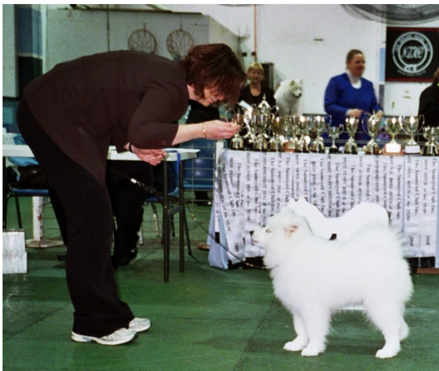
Above: Baby Puppy Bitch 1st Kelljass Paw Prints In Snow