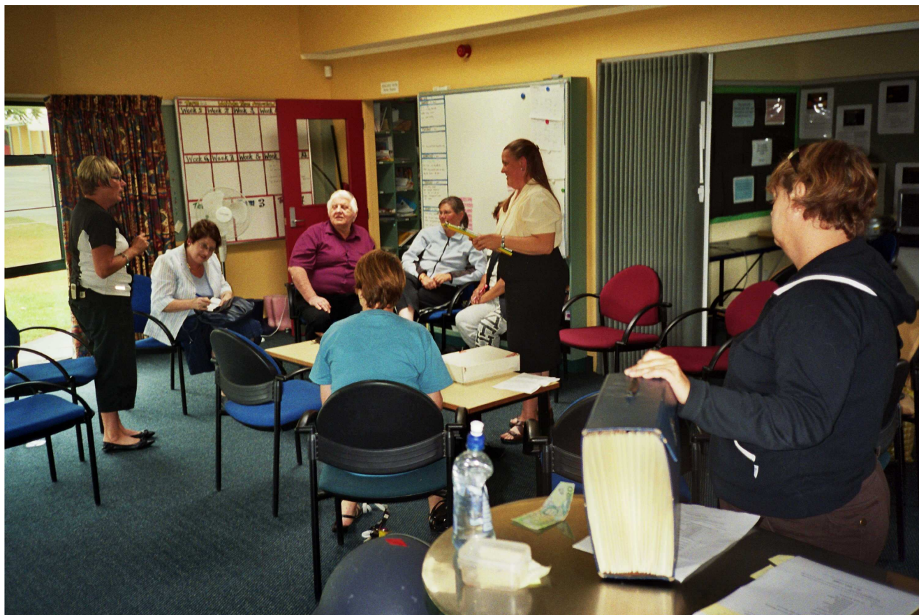
The newly appointed 2008 committee gets down to business