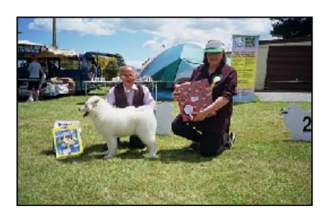
Baby Puppy in Show Elanra Staravasna Shiraz (Turner)