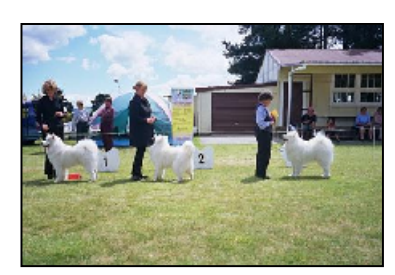
Movement over 12mths