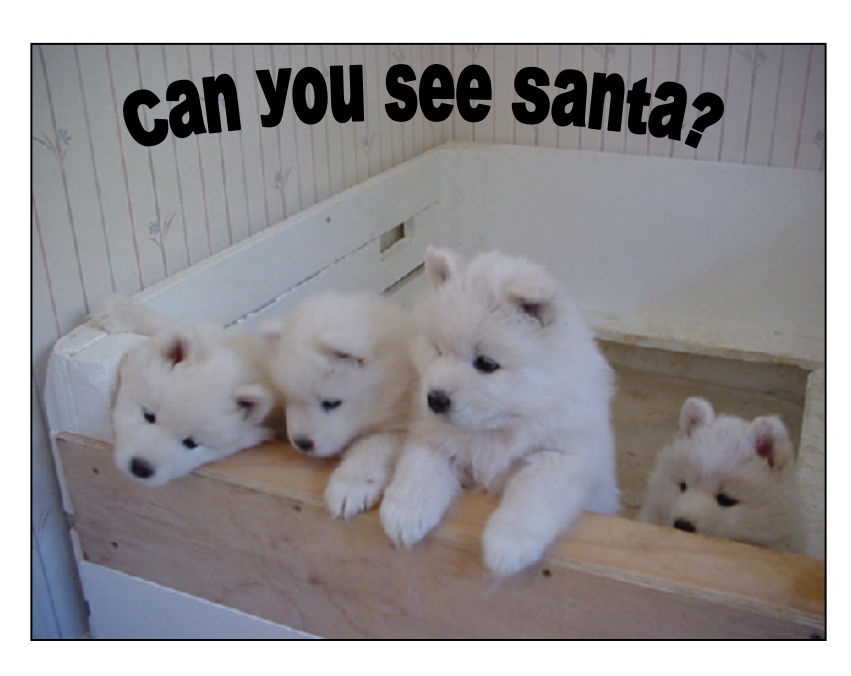
Wishing everyone a Merry Xmas and Happy New Year From Everyone at