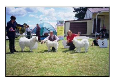
Movement under 12mths