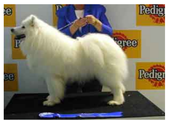
NZCh Aldonza Kid N Lace (Imp Aust) (Carleton)