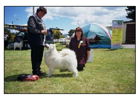
Reserve and Limit in Show Kelljass Arctic Snow Dream (Kelly)