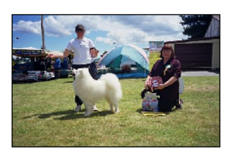
Intermediate in Show Angara Parus Painter (Barr)