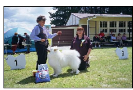
Veteran in Show CH Elanra Novasna (Turner)