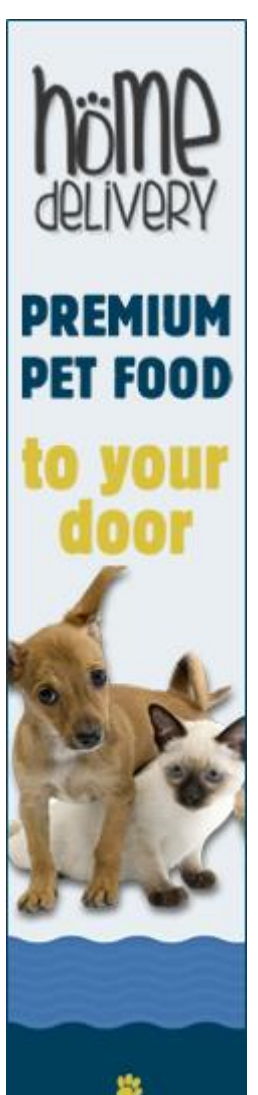
petfoodsales.co.nz 0800 PET FOOD