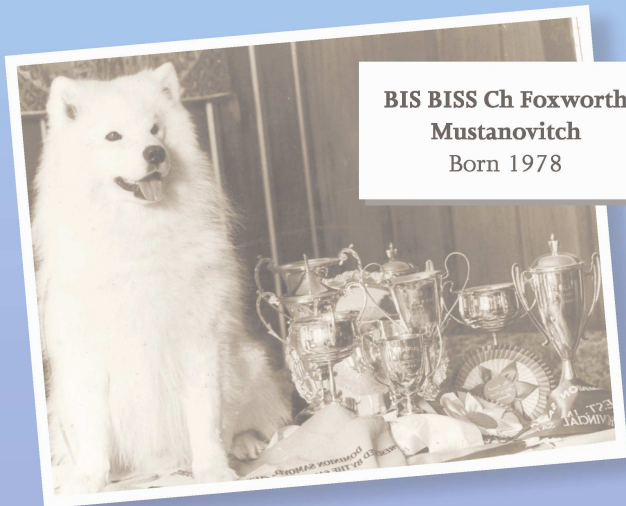
BIS BISS Ch Foxworth Mustanovitch Born 1978