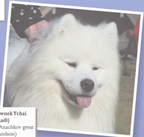
BIS Ch Skrownek Tchaj Vennadij Born 2014 (an Anachkov great great grandson)