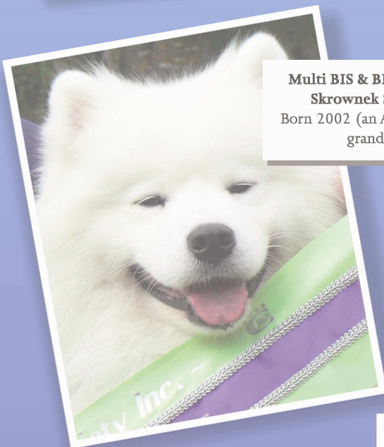
Multi BIS & BISS Grand Ch Skrownek Sev Kazan Born 2002 (an Anachkov great grandson)